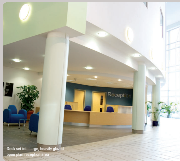
Desk set into large, heavily glazed open plan reception area

Project: Aylesbury College, Aylesbury, Bucks.