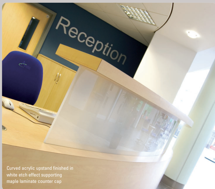
Curved acrylic upstand finished in white etch effect supporting maple laminate counter cap