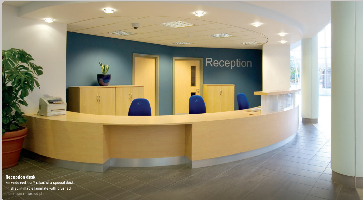
Reception desk 8m wide evolution® classic special desk finished in maple laminate with brushed aluminium recessed plinth